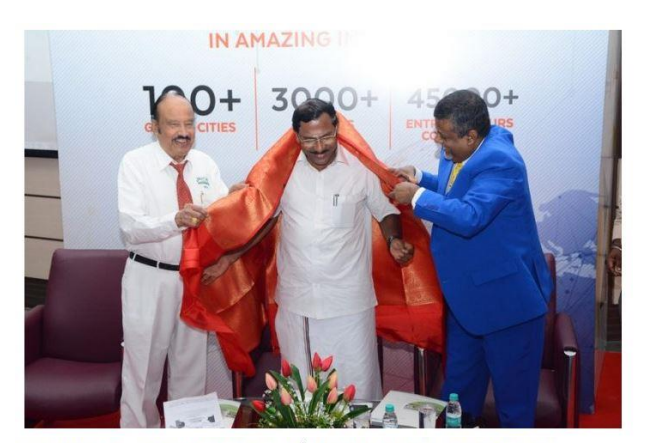
Great lakes chennal organizes 4^{th} annual global convention of entrepreneur café at campus