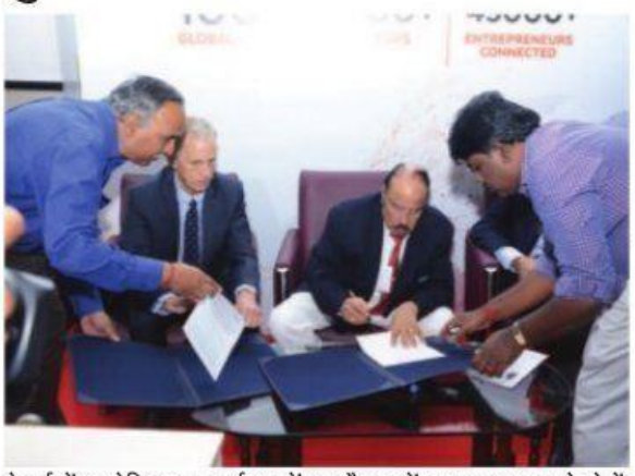
चेन्नई में आयोजित एक कार्यक्रम में समझौता पत्रों पर हस्ताक्षर करते दोनों संस्थानों के अधिकारी।