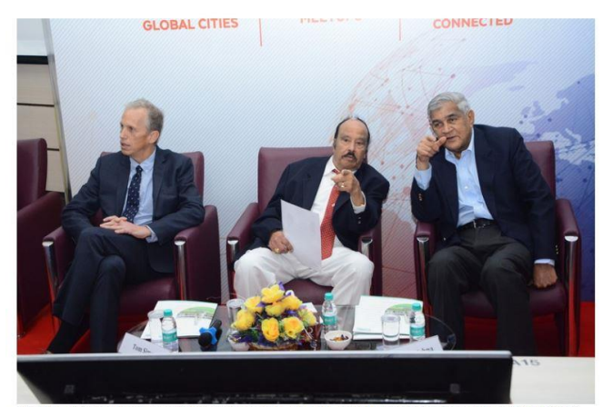
GREAT LAKES CHENNAI ORGANIZES 4<sup>th</sup> ANNUAL GLOBAL CONVENTION OF ENTREPRENEUR CAFÉ AT CAMPUS

Startup Awards to appreciate the innovations and technology advancement by local entrepreneurs, industrialists and startups whose contributions towards the society and organization is incredible but goes unpoticed."