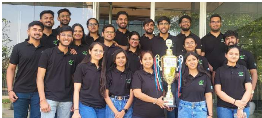
Best Performing Club – Finance Club