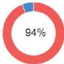
Of recruiters use or plan to use social media for recruiting