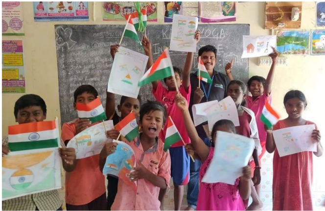
Team of Andimadam celebrated independence Day with kids of Andimadam village.