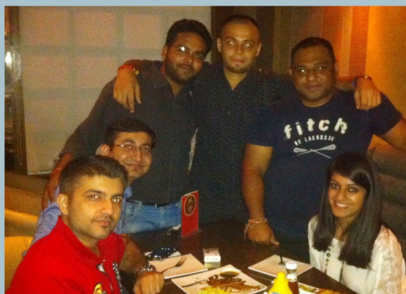
Clockwise — Hyderabad meet, Bangalore meet, New Delhi meet