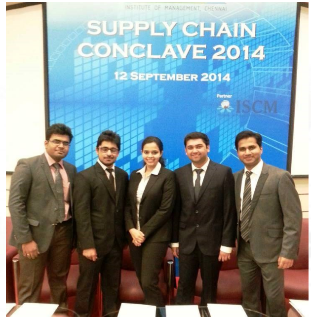
The Supply Chain Operations Committee