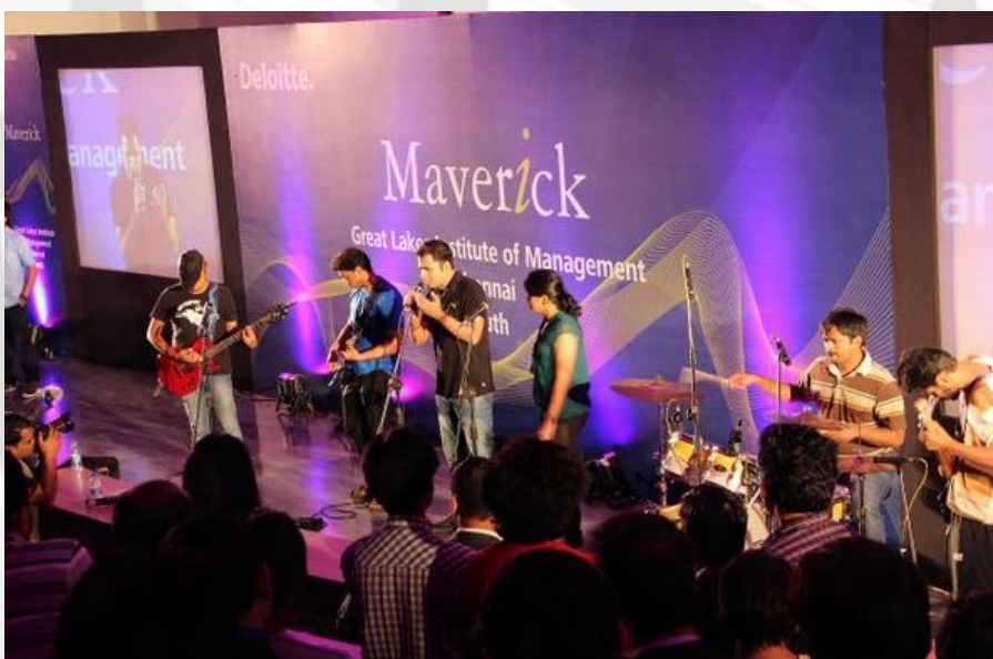
Pox Blot's performance

In the early morning, teams were tested for their unconventional thinking, solutions mind set and business acumen as the boardroom round was in progress. ‘GLIM WIZs’ and ‘VINI VIDIVICI’, the teams from Great Lakes were two of the competing teams. Out of these, six teams qualified to present the case. ‘GLIM WIZs’ was one of these to present their solution to the panel of judges comprising of senior leaders of Deloitte in the stage round. Hosted in Lake Veeranaam and Mansarovar, the participations set the stage on fire. The crowd was all in a mood to cheer up their colleagues and enjoy the beats to the fullest. The stage round was followed by the “War of Bands” round. Great Lakers were tuned to the music in the air forgetting their exams and assignments. Deloitte team was more than glad to see the enthusiastic Lakers and the response from the college.